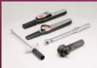
Torque Wrenches & Tools