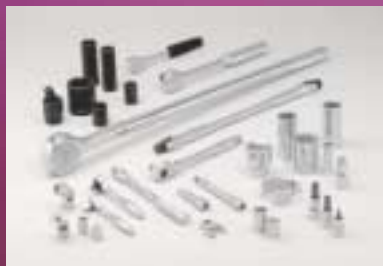
Sockets, Ratchets & Attachments