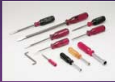
Screwdrivers & Nut Drivers

For full-line coverage of all your hand tool needs, visit us on the web: www.wrighttool.com . Or, call toll free: 800.321.2902