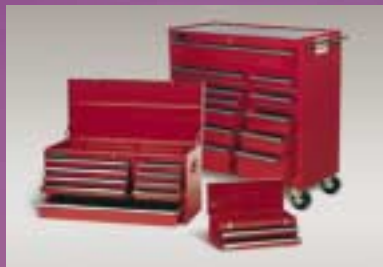
Tool Chests, Cabinets & Boxes